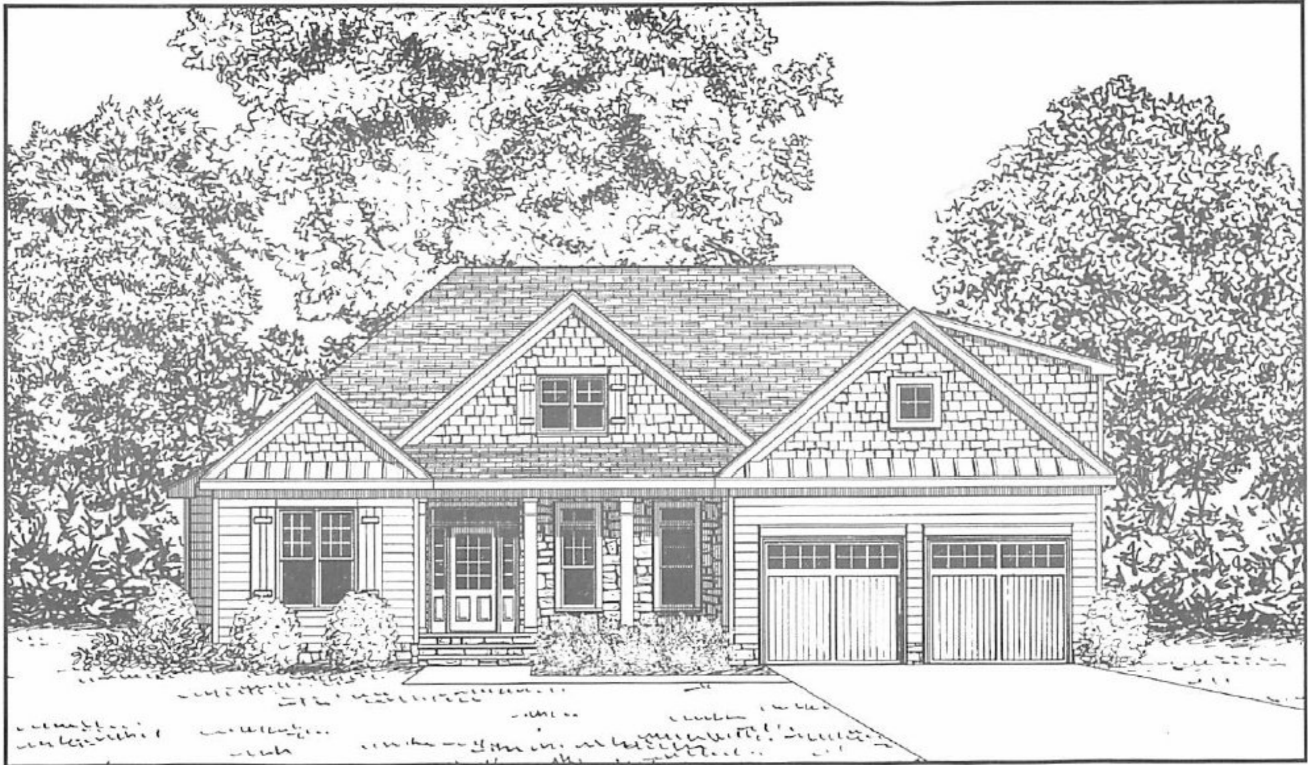
The Pinetop Cottage

3 Bedrooms / 2 Baths / Rec Room / Screen Porch / 2 Car Garage Optional Bedroom 4 and Bath